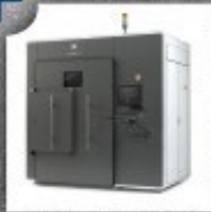
METHODS MACHINE TOOLS' ProX DMP 320 3D Printer