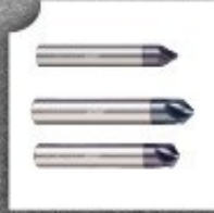
HELICAL SOLUTIONS' High Performance Chamfer Mills